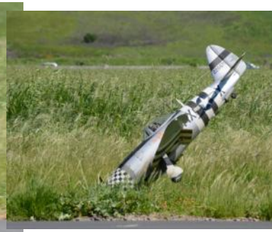
Looks like so many of my landings. Ed.