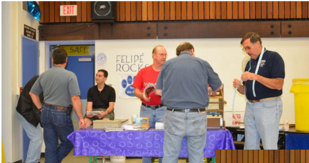
Raffle in full swing.