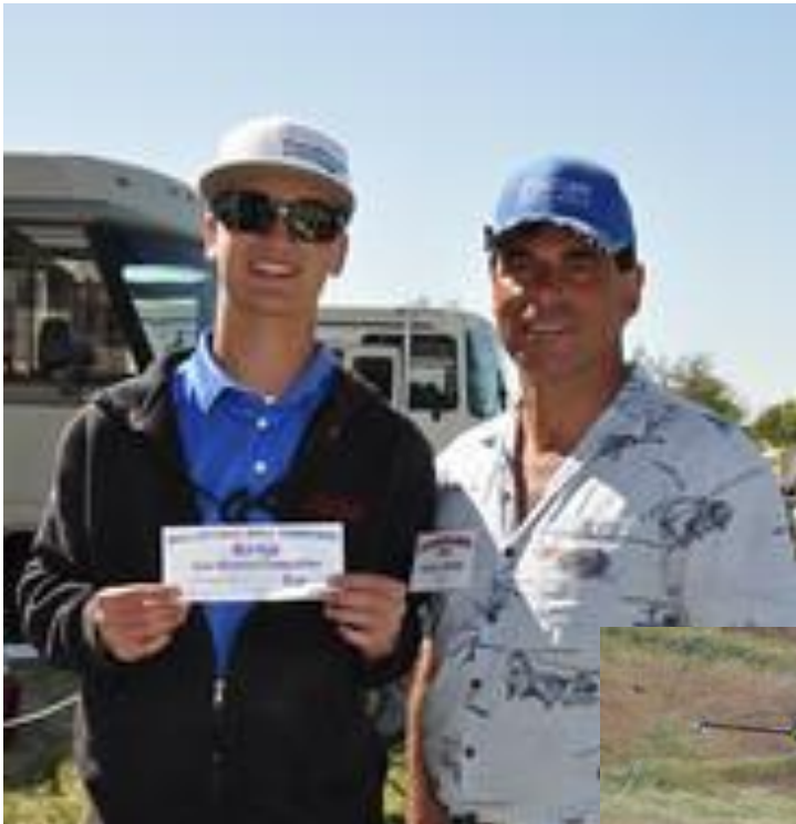
Heli Fun Fly Photos