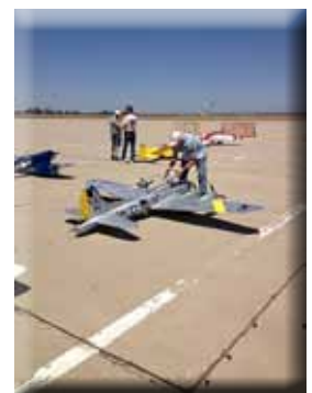
Ken Safer built and flew this awesome Zero!