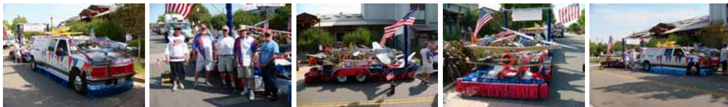
July 4th Parade, Morgan Hill