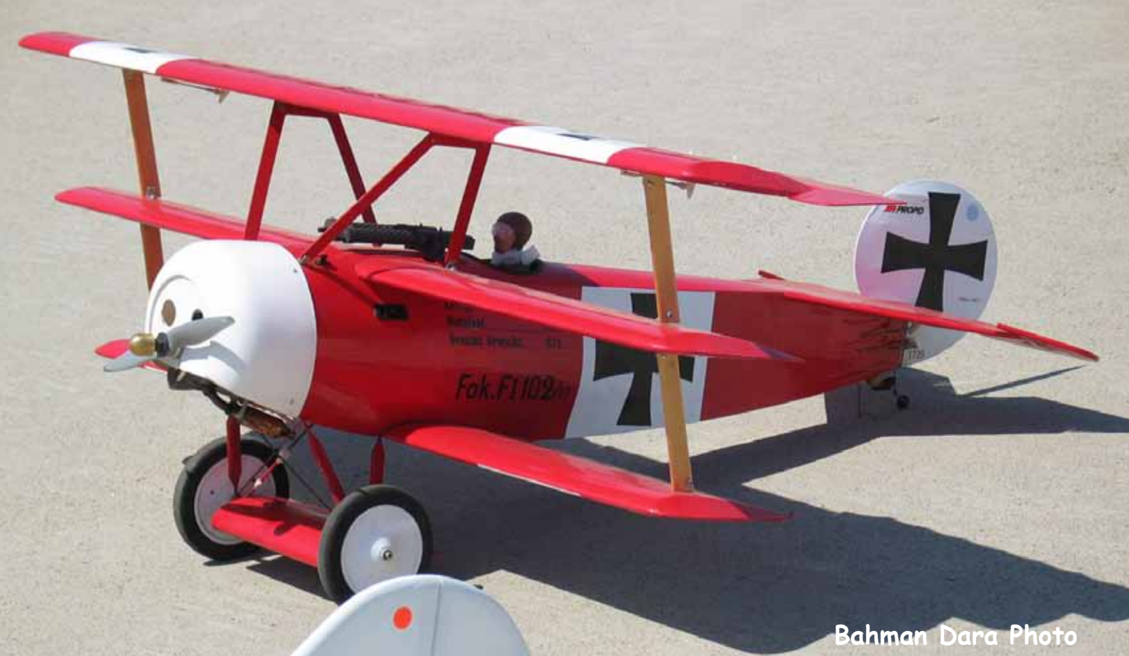
Bahman Dara Photo